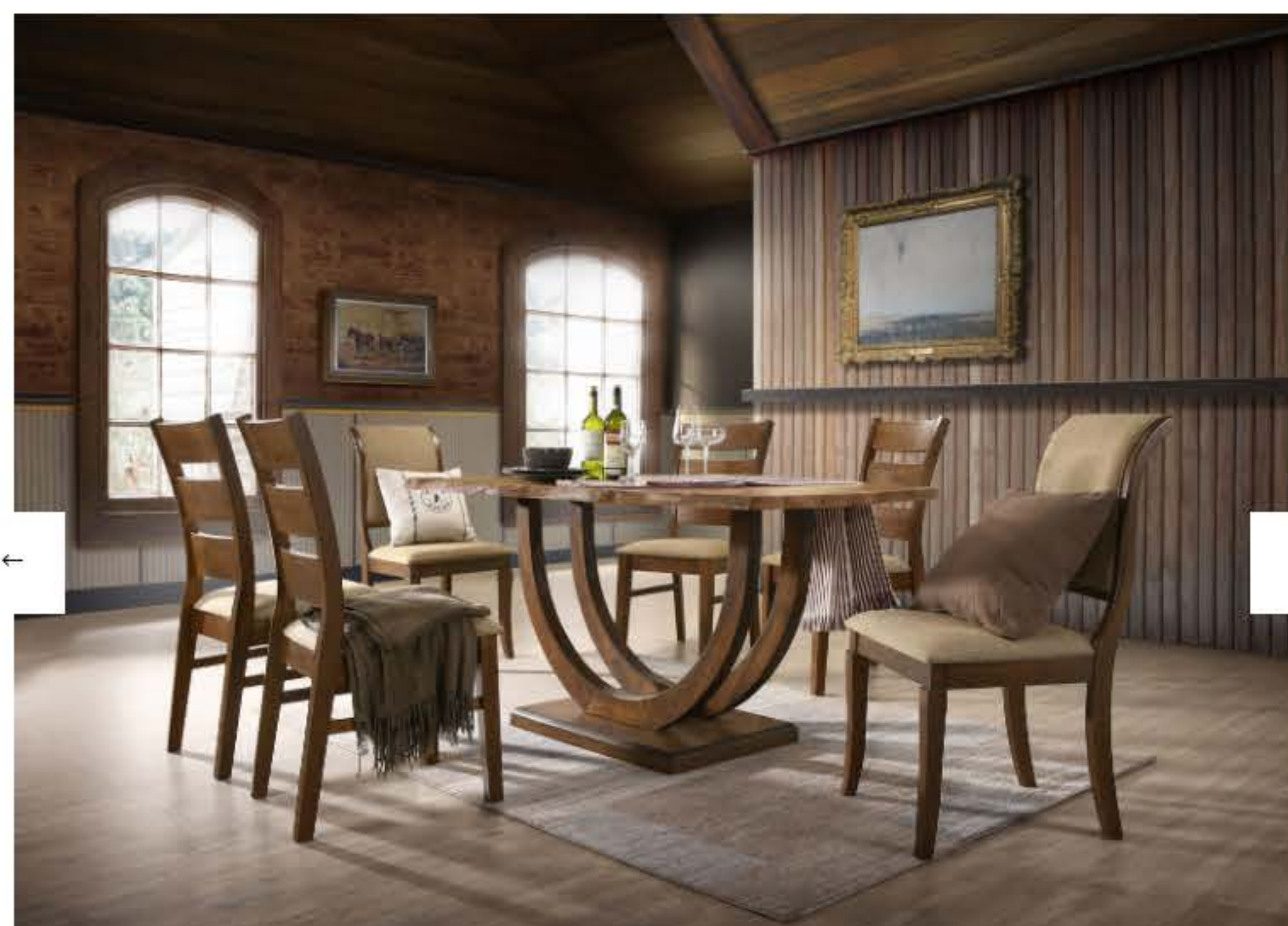
Ker Global Furniture dining set