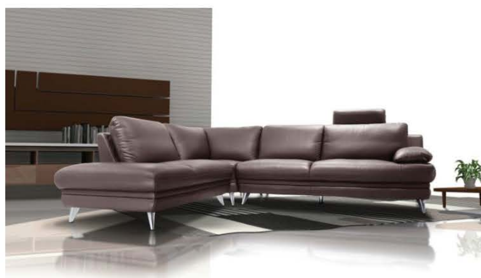
Omega Sofa set

The best furniture fair in Southeast Asia and consistently ranked among the top B2B furniture fairs in the world, the Malaysian International Furniture Fair has spearheaded the furniture trade scene since its inception in 1995. A dynamic platform that brings together renowned exhibitors, brands, and buyers, it is the hotbed for discovering the latest in furniture trends and designs, and connecting people and creating business opportunities. And the 2020 edition, which is set to take place in March this year in Kuala Lumpur, promises even more.